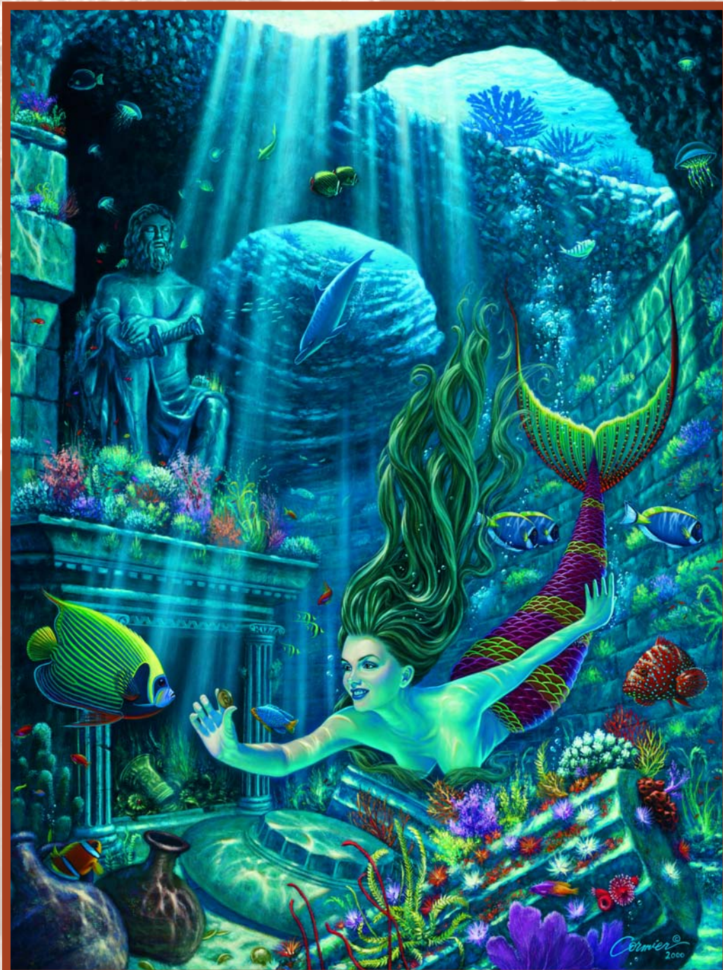
"POSEIDON'S TREASURES" Limited Edition Giclee on Canvas and Water Color Paper