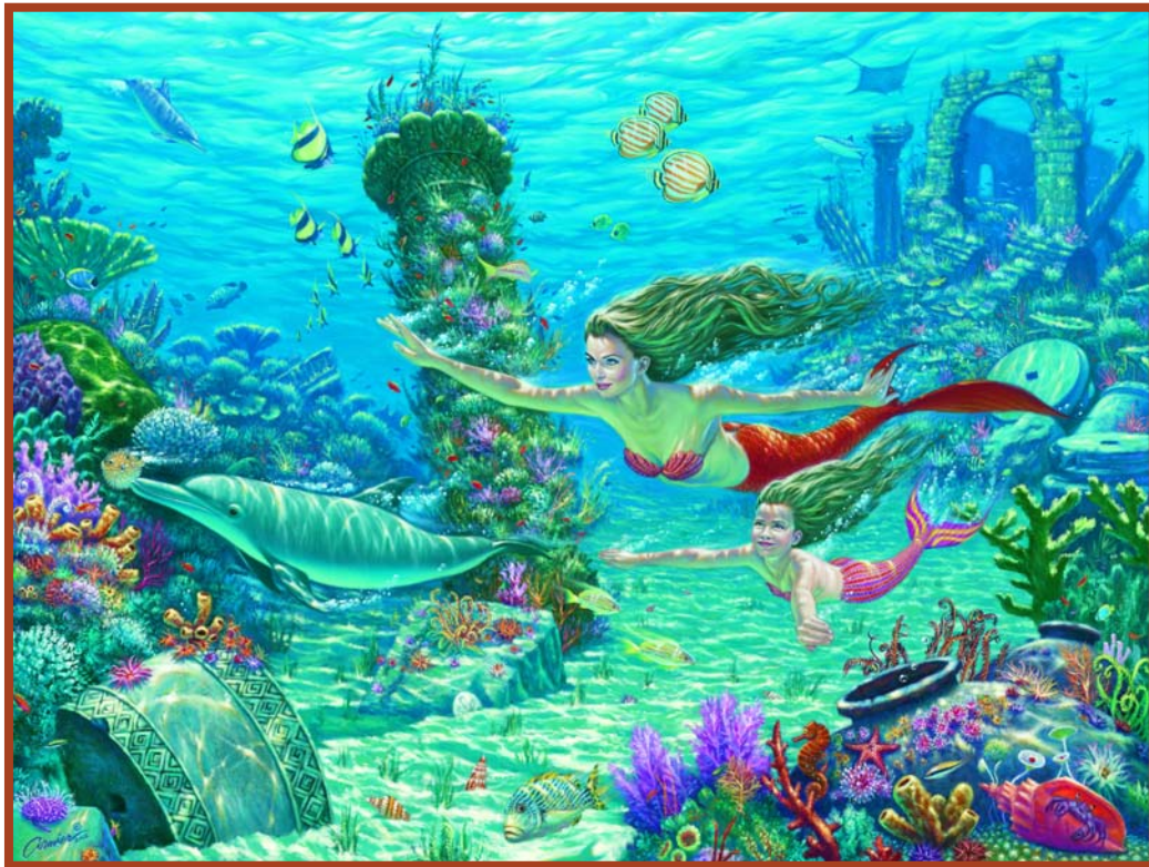
"THE SWIMMING LESSON" Limited Edition Giclee on Canvas

Incredible beauty. Uncompromising quality. Exceptional value. Every print is a magnificent "Giclee" reproduction on acid-free stock, and is published from the artists original oil painting. All prints are signed by the artist, consecutively numbered and accompanied by a personalized certificate of authenticity.