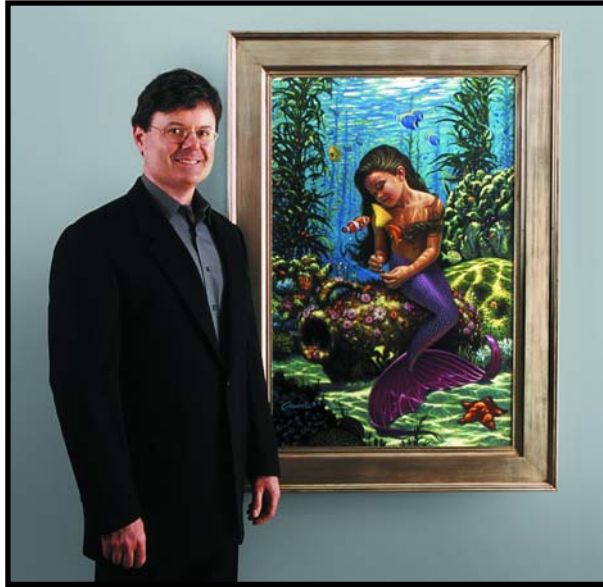
"DISCOVERY" Limited Edition Giclee on Canvas

Giclee shown above with artist measures 28" x 42". Also available in sizes 20" x 30" Unframed